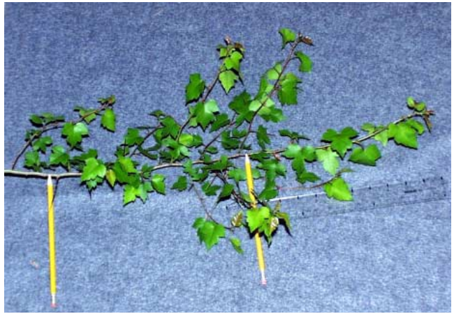
Figure 2. Twig growth on a young tree should be 9 to 12 inches per year. The space between the first two bud scale scars (indicated here by the pencils) is last year's growth.

12 inches or more per year (Figure 2). Large, mature trees may grow only 4 to 6 inches per year.