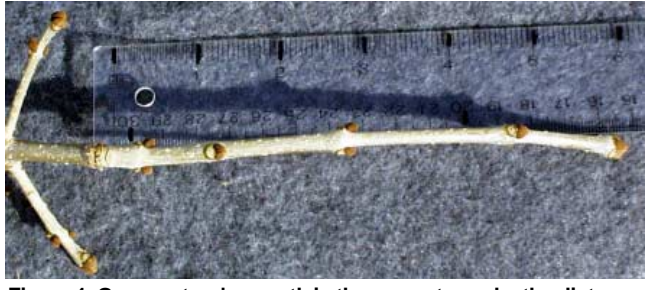
Figure 1. Gauge a tree's growth in the current year by the distance between the tip of a twig and the first bud scale scar.

Determine general tree vigor by checking the growth of several twigs during the past three or four years. Twig growth on most young trees should be 9 to