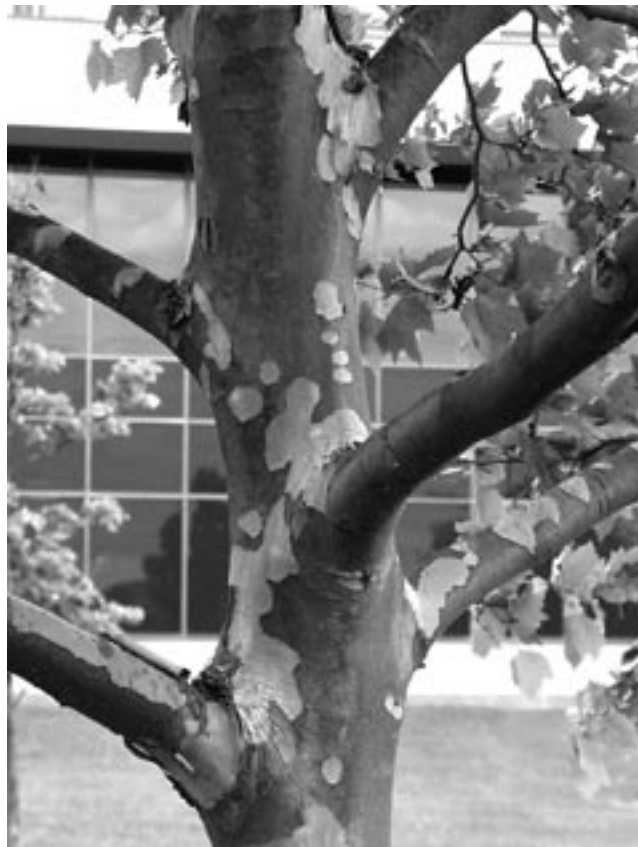
Figure 1. Scaffold branches should have good vertical as well as radial spacing.

One or two years after planting, start pruning the tree to improve its form. Select the main (scaffold) branches at this time. They should be well spaced along the main stem, smaller in diameter than the